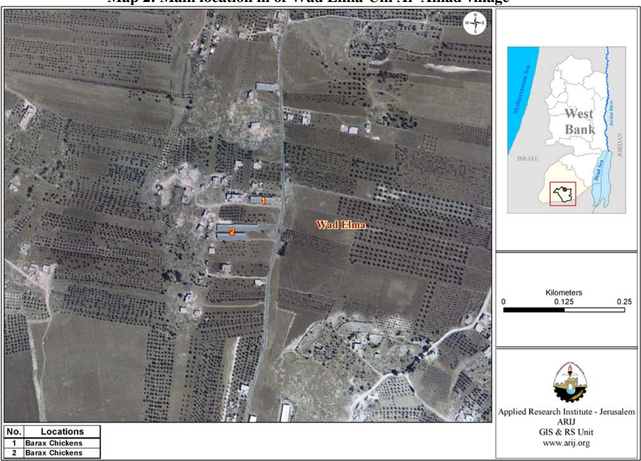
Map 2: Main location in of Wad Elma-Um Al 'Amad village